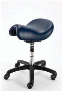
BSS 100 Series