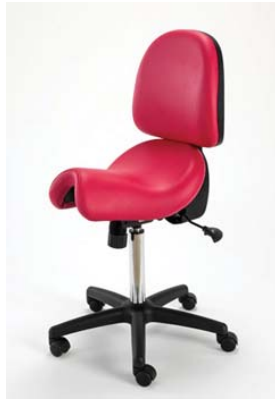
BSS 200 Series with Backrest